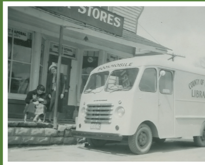
Original Bookmobile ca. 1949

2011 will be a year to celebrate and take pride in the Elgin County Library. We hope you can join us!